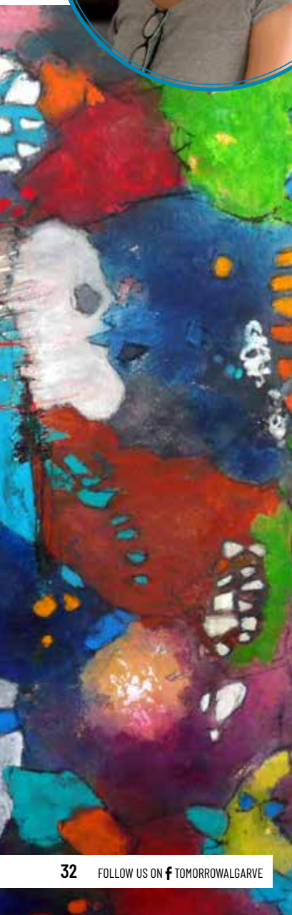
In the jungle, 50x150cm