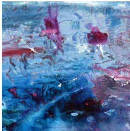
Lily pond, 80.5x116.5cm